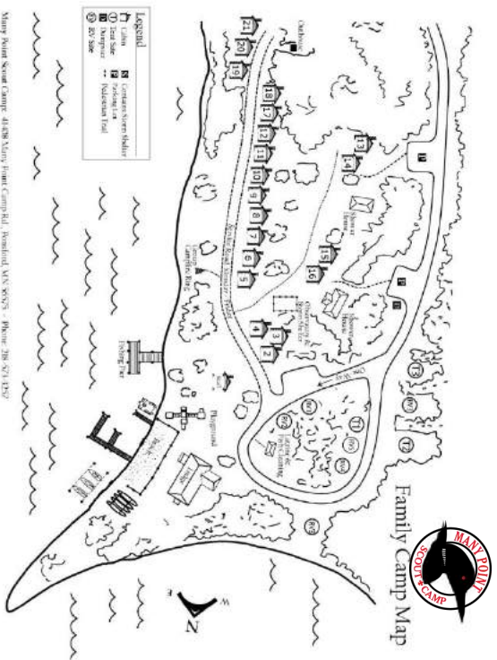
Many Point Scout Camp, 41408 Many Point Camp Rd, Ponsford, MN 56575 - Phone: 218-573-3257

L E G E N D Check-in & Info. At Family Camp Check-in at Family Camp Number 218-573-3257 Map NOT drawn to scale. ..... Township Roads --- County Roads --- U.S. Highways --- State Roads